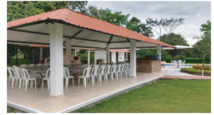
Kiosk - events