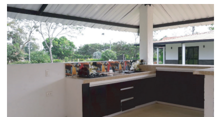
Kitchen / Kiosk